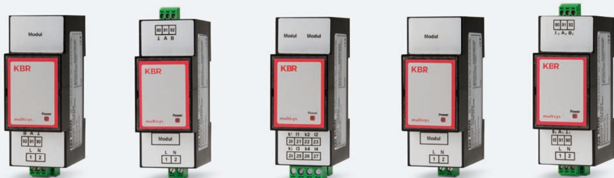
multisys Gateway 2D2-ESBS